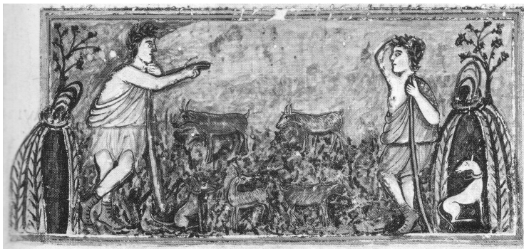
Figure: Illustration from the Eclogues , Vatican MS Latinus 3867, fol. 11 r