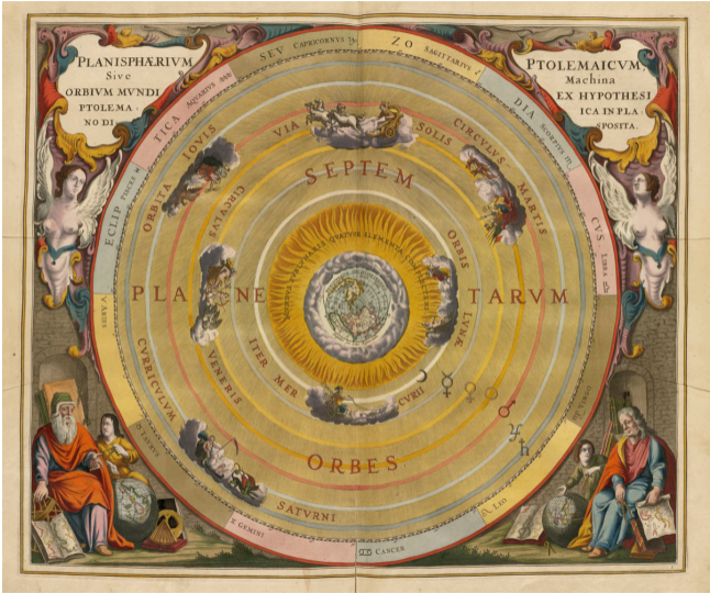
Figure: Ptolemaic universe (1661 CC-BY-SA NBL Map Center)