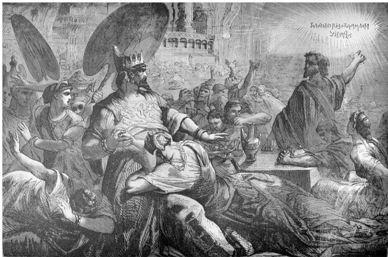
Figure 1: Belshazzar's Feast